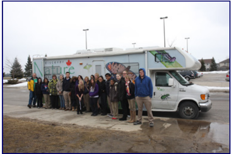
Students pose with the BioBus.

We were recently visited by the BIOBus, a mobile field laboratory (it looks strikingly similar to an RV), and students were introduced to the life of a field biologist and DNA barcoding.