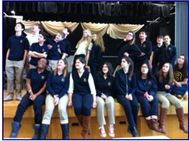
Some of the students involved in Rated T 4 Teen.

The students learned valuable teamwork skills and were very proud to complete the job on the final day of semester 1. We are planning to continue volunteering next semester.