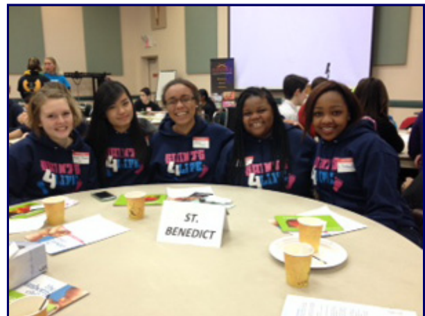
Members of the St. Benedict Saints4Life club.

If you are interested, you can sign out of your period 4 class for the 27th for $2. Come to the table in the atrium by the SAC office at lunch this week to sign up.