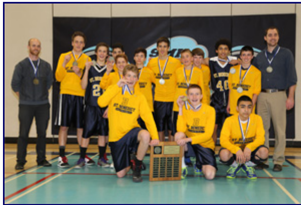
St. Benedict Midget Boys Basketball team--District 8 champions

A big congratulations goes out to the midget boys basketball team who held off Mary's to win the D8 championship. It was a hugely defensive game in the first half by both teams, but your Benny's boys held Mary's to just 2 points in the second half, leading to a victory and keeping their undefeated streak alive. Way to go boys!