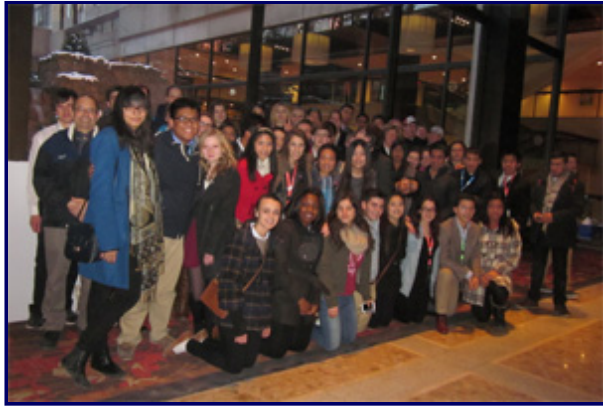
The St. Benedict C.S.S. DECA students in Toronto.

DECA is an academic business competition club that has grown to include over 30 categories, 200 high schools, and 10,000 students province-wide.