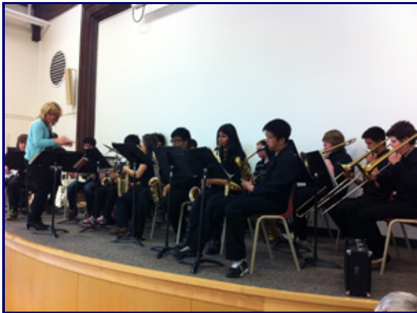
Swingin' Saints Jazz Band puts on an impressive performance.

The Swingin' Saints Jazz Band performed on Tuesday, May 6, 2014 at the Waterloo Catholic District School Board's Staff Recognition reception. This fifteen piece jazz band is comprised of players from all grades.