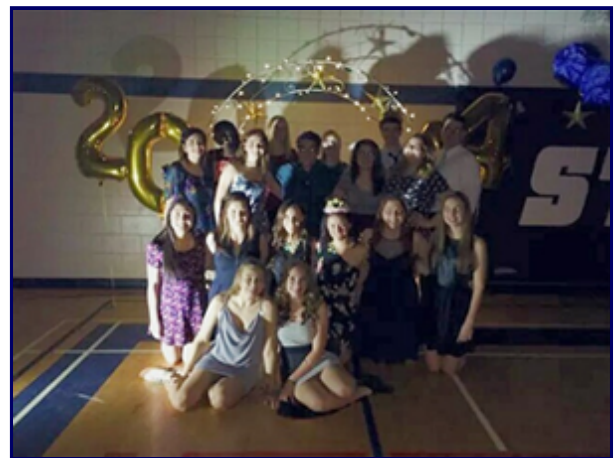
SAC members at the Homecoming Dance.

Thursday consisted of a fun filled Teachers Vs Students Dodgeball game. The game was held after school in the gym, and the competition was fierce. After multiple rounds, students reign the supreme competitors by winning against the teachers!