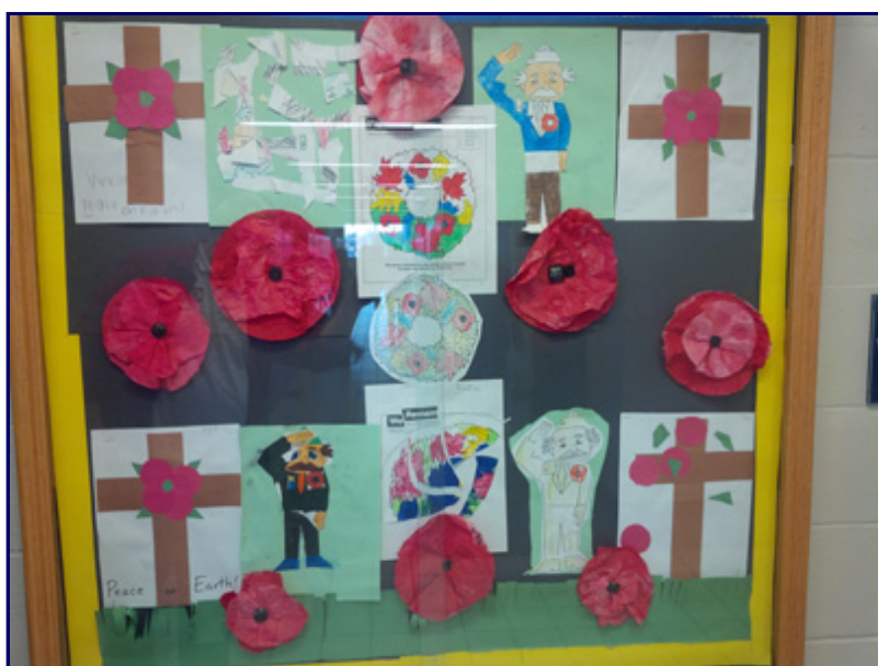
Students in the Life Skills class designed this display on the second floor.

Immediately following "Last Post", the crowd grew silent... many bowed their heads as we stood strong; proud to be Canadian!