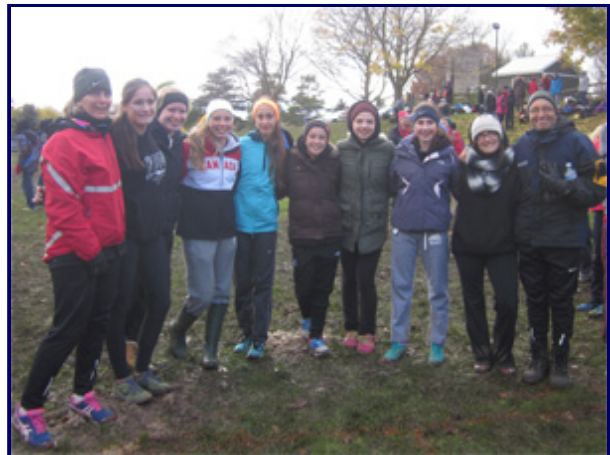
The cold weather didn't dampen our runners' spirits, as our girls finished top 8 for the second time in two years.