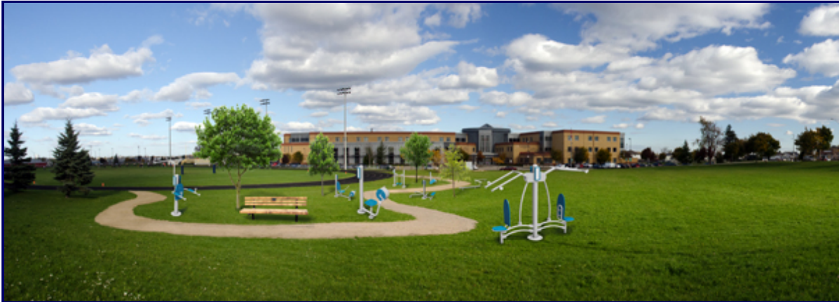
An artist's rendering of the gravel path with exercise stations. Benches and landscaping would also be added to enhance the use of the area.

We are less than a week away from the start of the semi-final round of voting! Register all your email accounts, get your family and friends to register, and come Monday get ready to start voting for the ♥ Heart of the Community ♥!