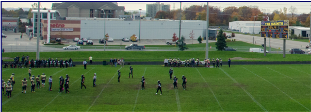
How the field would look with an added scoreboard.