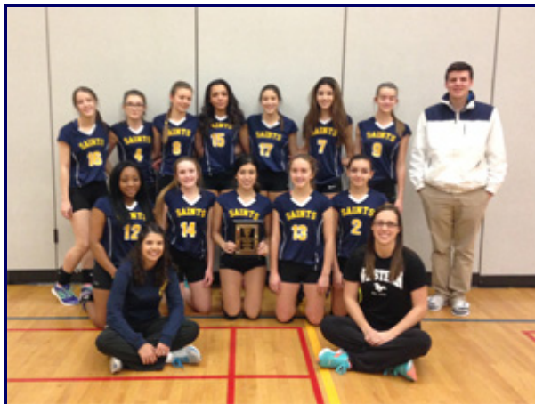
The girls are all smiles as they pose for a team photo with their second place plaque.

In regular league play, the girls have been 3-0 to start January. Last Monday they defeated Woodland in four sets. It was a great team effort that included battling back to win the third set after being down 24 to 19.