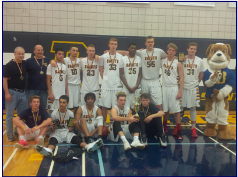
The St. Benedict Saints Senior Basketball Team, and 28th Saints Invitational Tournament champions.

For details and highlights from the tournament, check out our Saints Invitational webpage, or follow @SBCSSBasketball on Twitter.