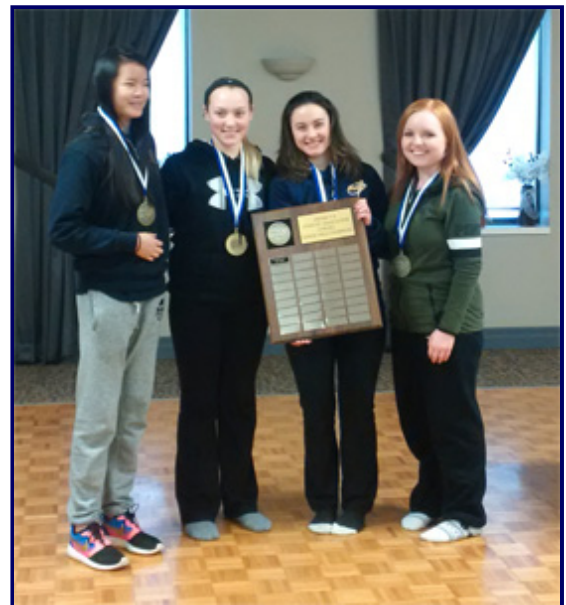
Our district 8 winning girls team.