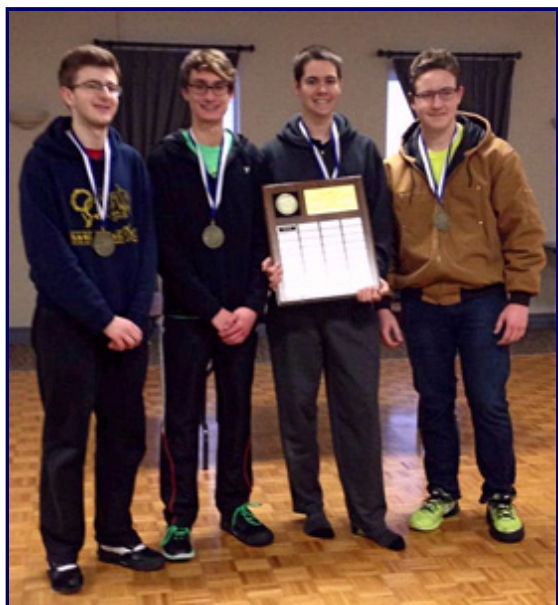
Our district 8 winning boys team.