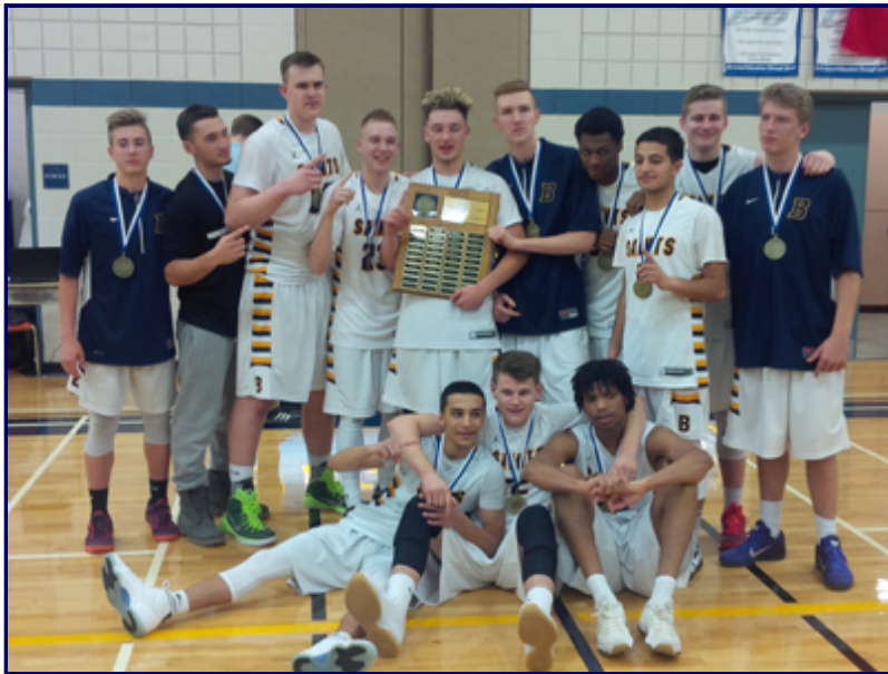
Our district 8 winning senior boys basketball team.