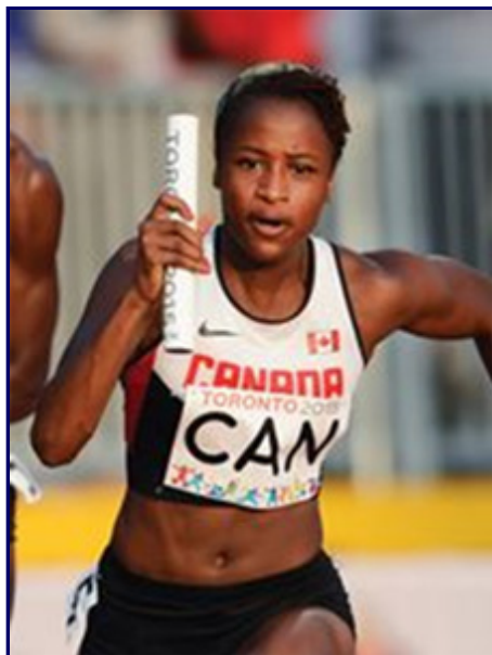
... to running for Canada.

The test consists of two booklets, each containing multiple-choice and open-response questions. The test is given on one day in two 75-minute blocks. All of the questions are based directly on the expectations set out in