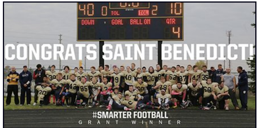
The image tweeted out by Riddell Sports to announce that our school was one of the grant winners.

organizations from across North America have received $10,000 in equipment upgrades from Riddell. The helmet manufacturer's Smarter Football initiative recognizes such football programs throughout the United States and Canada for their commitment to implementing safer and smarter playing techniques, whether in practice or for games. All youth, secondary and college programs were eligible to apply for a Smarter Football grant. With over 1,000 applications, St. Benedict was the only Canadian program to be named a winner.