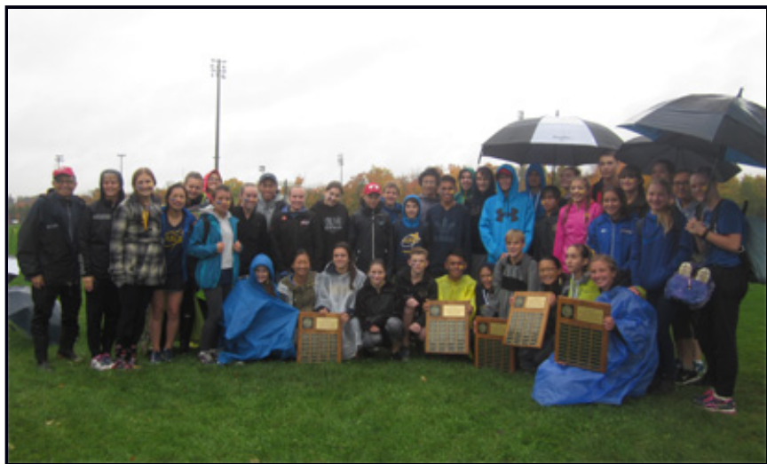
The Saints X-Country Team at District 8. The team captured 6 of the 9 plaques, the best performance since 2002.

It was a very successful day for the Saints X-Country Team at District 8 where the team captured 6 of the 9 plaques, including all 3 overall categories, and finished no worse than second in all divisions. This is the best performance for the team since 2002.