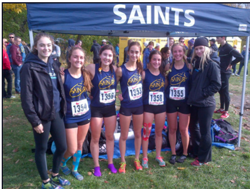
Members of the St. Benedict 2016 Senior Girls Cross-Country Team.