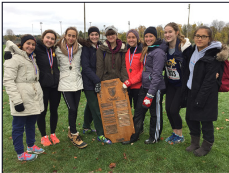
Members of the Senior Girls Cross-Country Team with their plaque.

It was a successful meet for the team, with the Junior Girls finishing 4th, and the Midget Girls and Senior Boys teams finishing 6th.