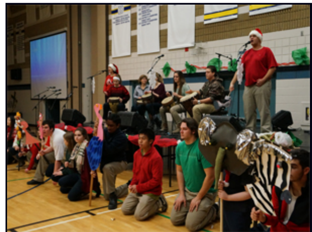
Students with special needs join the Leadership class for a musical performance at the Christmas assembly.