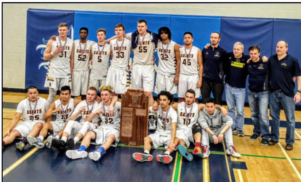
HISTORY IN THE MAKING: The St. Benedict Senior Boys Basketball team, CWOSSA 2017 champions