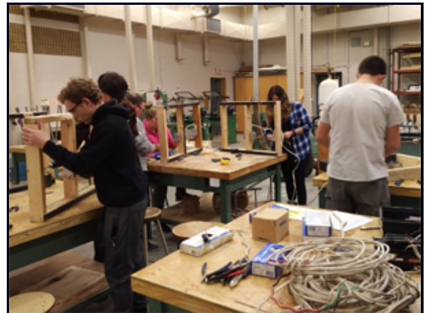
Student drill holes to run wires which they eventually connect to an outlet to perfect their electrical skills.