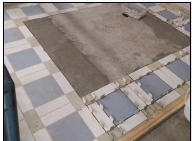
Students practice their tiling skills in the mezzanine of the Construction classroom.