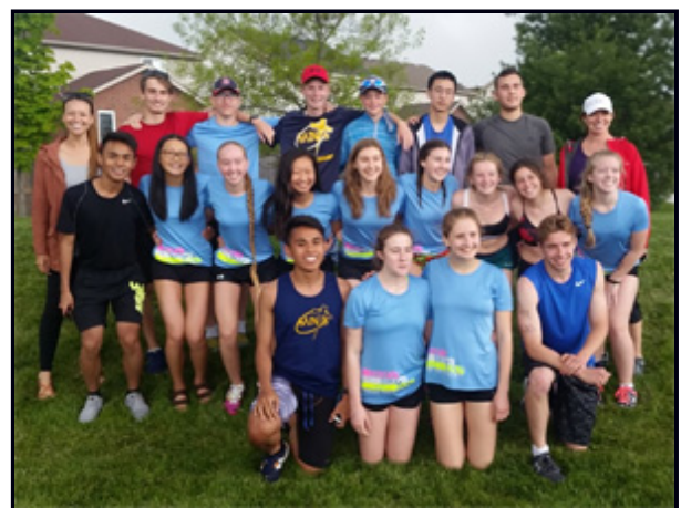
St. Benedict triathletes before heading out for a day of swimming, biking, and running.