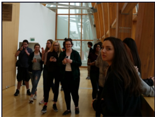
Students touring the Art Gallery of Ontario.

On May 11th, the grade 9, 10, 11 Visual Art and 4M Design classes boarded the bus to the Art Gallery of Ontario in Toronto.