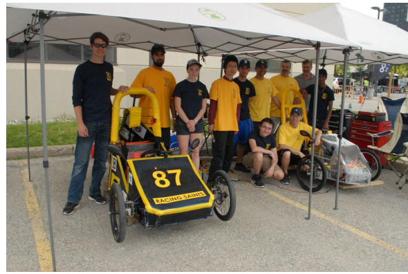
Members of the E-Car team pose with their vehicles.

Congratulations to the Racing Saints on a successful race season!