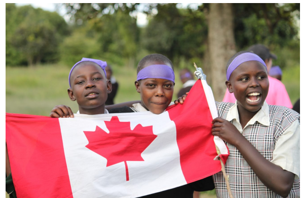
Olympic Day at Laila Primary School