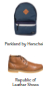
Parkland by Herschel