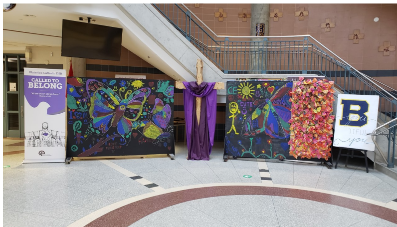
Butterfly murals painted by St. Benedict students.

Our board pastoral theme for the year is “Gathered to Become.” Becoming means transformation. The symbol for transformation is the butterfly. As the caterpillar transforms slowly into a butterfly, so we are slowly being transformed into the image of Christ. During semester 1, classes were invited to the Atrium to paint two large butterfly murals.