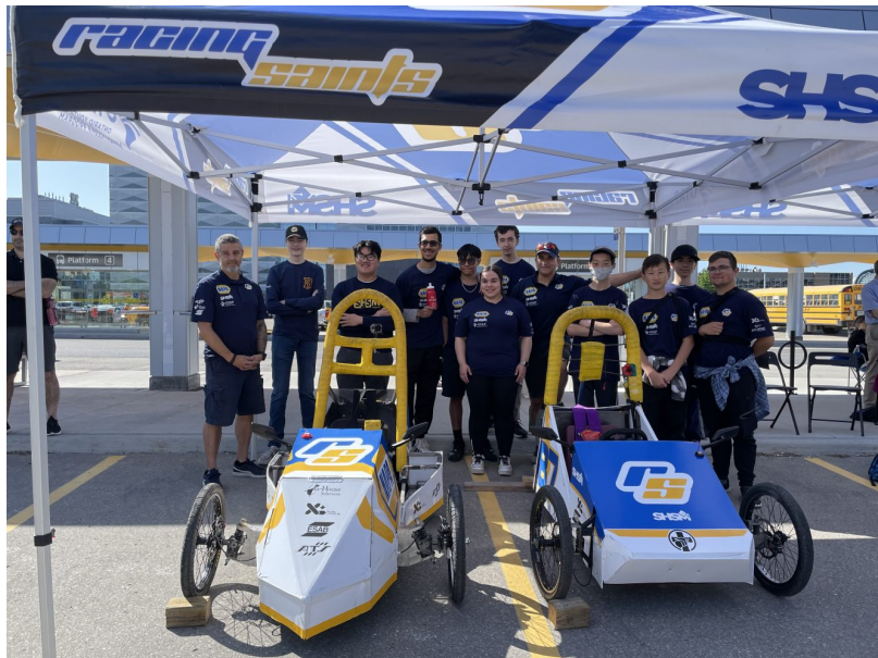
Members of the team with their two cars.